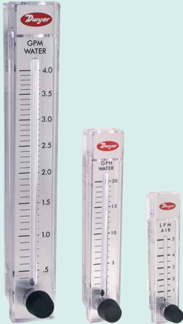
Model RMC-SSV10® scale, 15" high